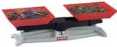
DOUBLE PAN BALANCE